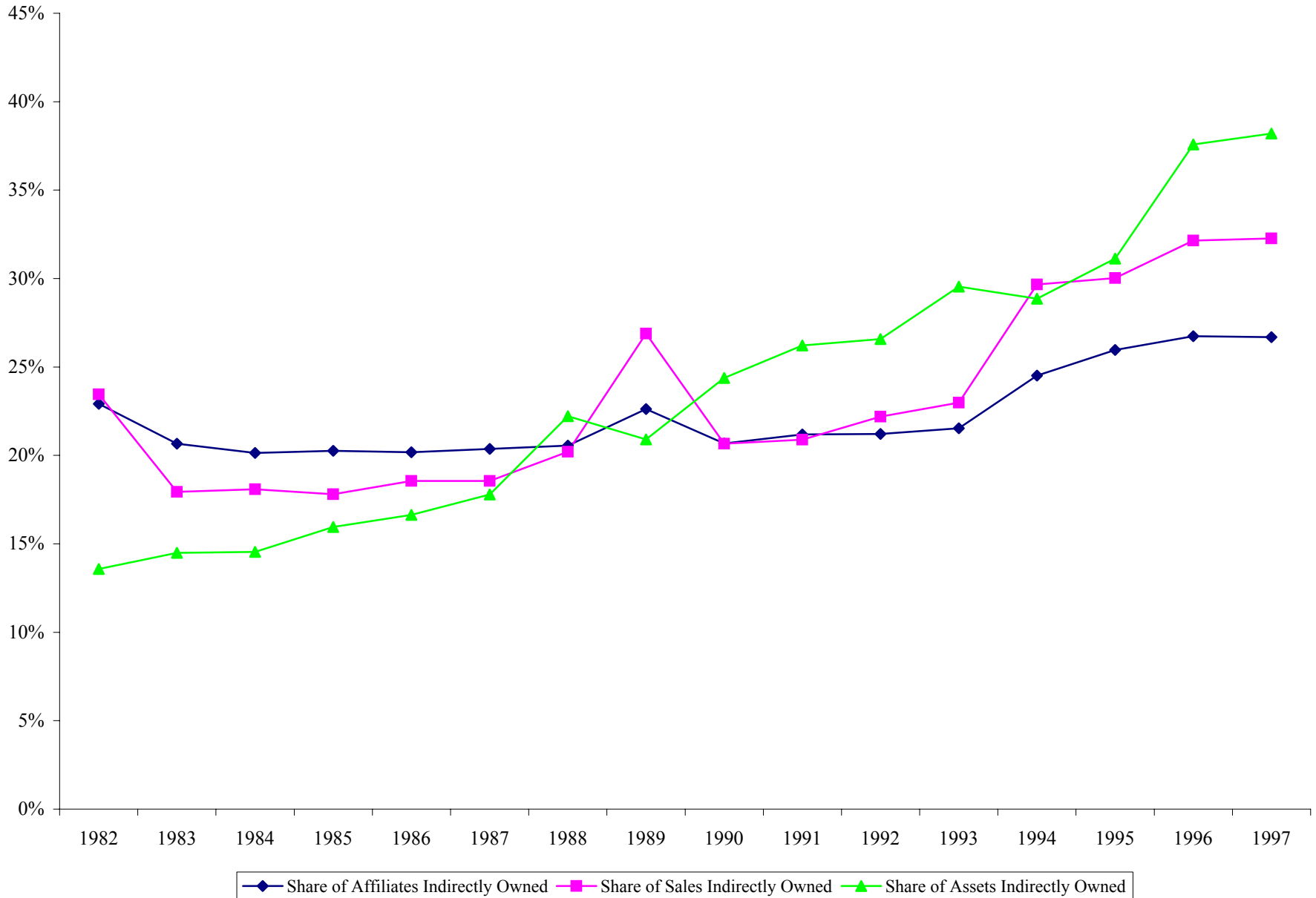
Figure 2: The Role of Chains of Ownership in U.S. Direct Investment Abroad, 1982-1997

Note: The loci detail ratios of numbers of affiliates with at least some indirect ownership by American parents, and their sales and assets, to comparable figures for all American-owned foreign affiliates from 1982 to 1997.